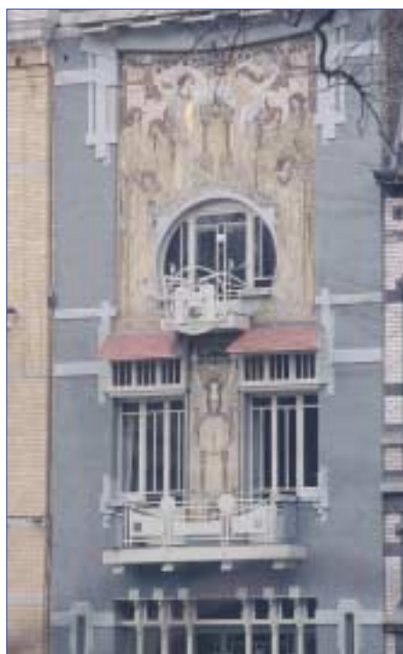
Brussels - city of 'Art Nouveau'