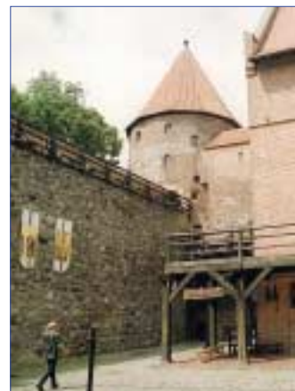
Bytow castle, Pomerania