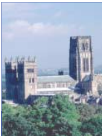
Durham cathedral and castle, North East of England