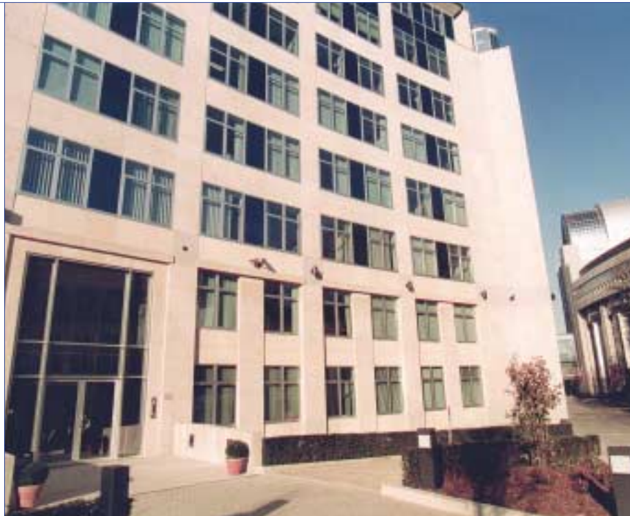
The Office of the Northern Ireland Executive

Registered participants to this workshop will receive a pre-seminar paper, addressing the key issues in more detail.