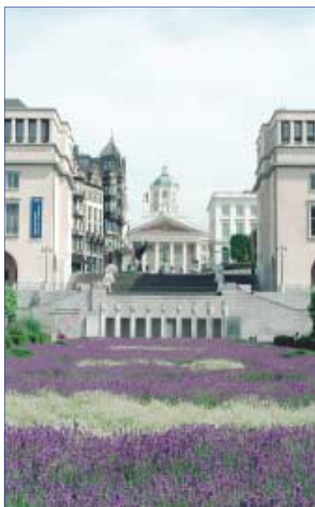
Brussels - city of culture and nature

By targeting key economic, academic and political players in Brussels and current and future operators of European programmes, this seminar seeks to provide some initial insights into the priorities the Brussels Capital region will have to address in the future. Whilst the trend towards greater recognition of the needs of urban areas has been a distinct feature of European policy in recent years, the current impact of the Structural Funds on urban areas is still clearly inadequate. Recent Commission proposals to support urban areas, as set out in the 3rd Report on Economic and Social Cohesion (February 2004) are a positive step forward; this applies not only to the Urban + proposal, but especially to the measures outlined in the 'Regional competitiveness and employment' priority. The question we now face is: How do we achieve the Lisbon objectives? What kind of innovation, research and urban regeneration projects should Structural Funds be geared to? How can the Brussels-Capital Region make best use of this European 'added value' factor in order to meet these challenges and turn them into real opportunities?