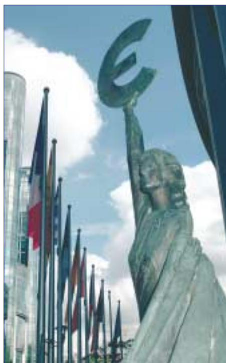
Brussels - capital of Europe