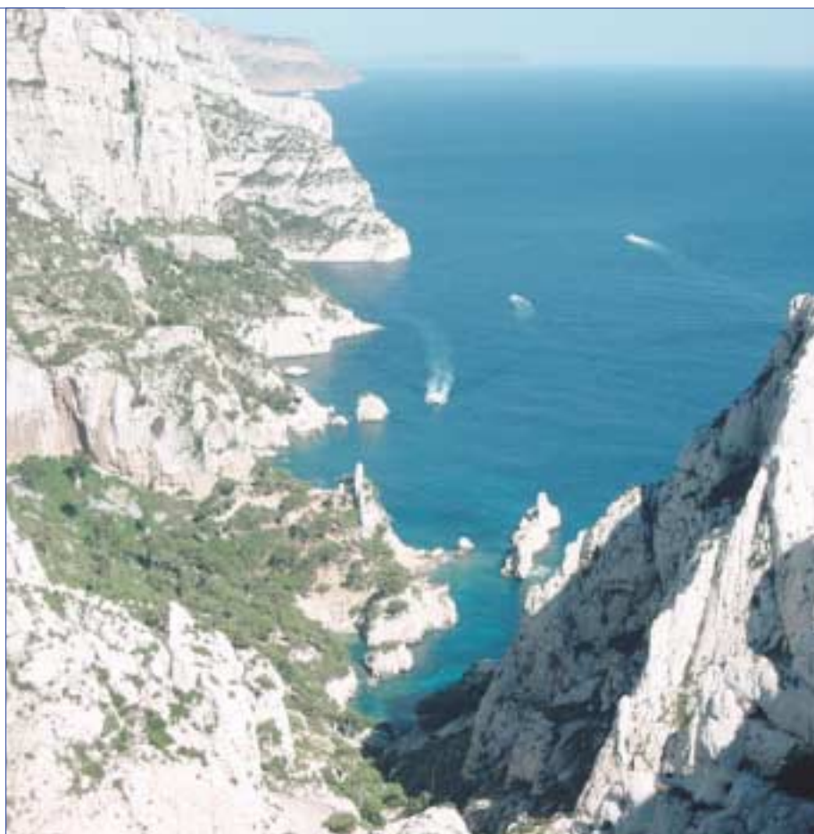
Mediterranean sea as we can feel it.

Contact Person: Davide Donati davide.donati@valleeurope.net Valle d'Aosta, Rue des Trèves 49-51, 1040 Brussels – Tel. +32-2-282.18.50 – Fax. +32-2-282.18.58