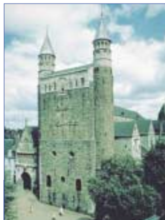
Olvbasiliek, Province of Limburg