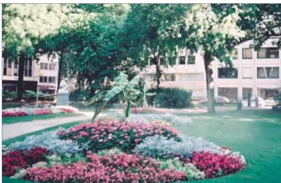
The park in front of the South East England House

This workshop for politicians will review the European Commission's progress on reforming EU regional policy and our contribution to that process over the last year. Representatives from each Dynamo Region will present their region's perspective. The event will conclude with participants from the Dynamo Regions adopting a formal statement on the reform of EU regional policy, which will be delivered during the CoR plenary session.