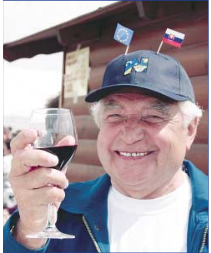
Celebrating enlargement in the regions: 1 st May at the 3 Countries Day in Lower Austria