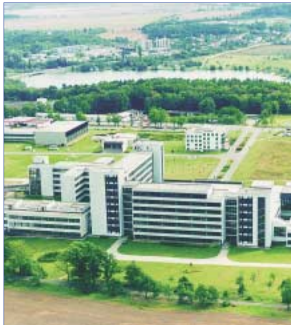
West Bohemian University, Pilsen