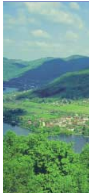
The Labe River in Ústí Region