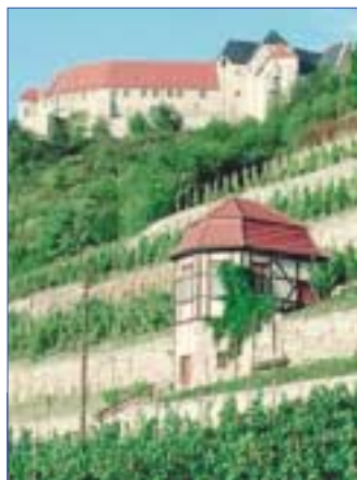
Vineyard, Freuburg-Unstrut, Saxony Anhalt