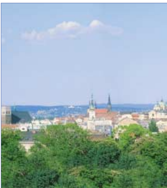
The City of Olomouc