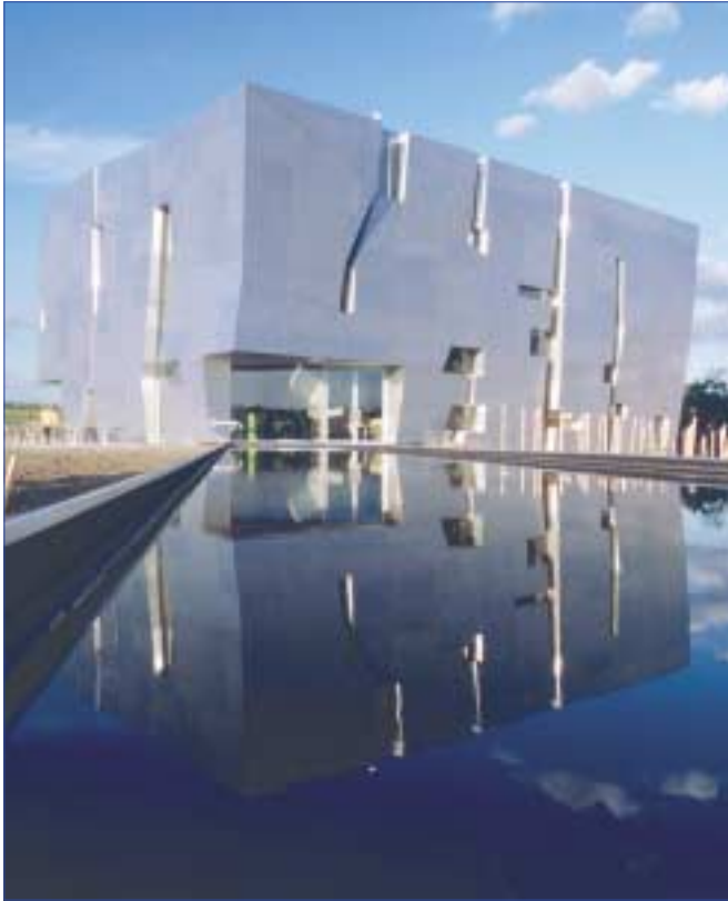
Loisium in Langenlois (Lower Austria): Tourist magnet for wine enthusiasts (co-financed by EC)