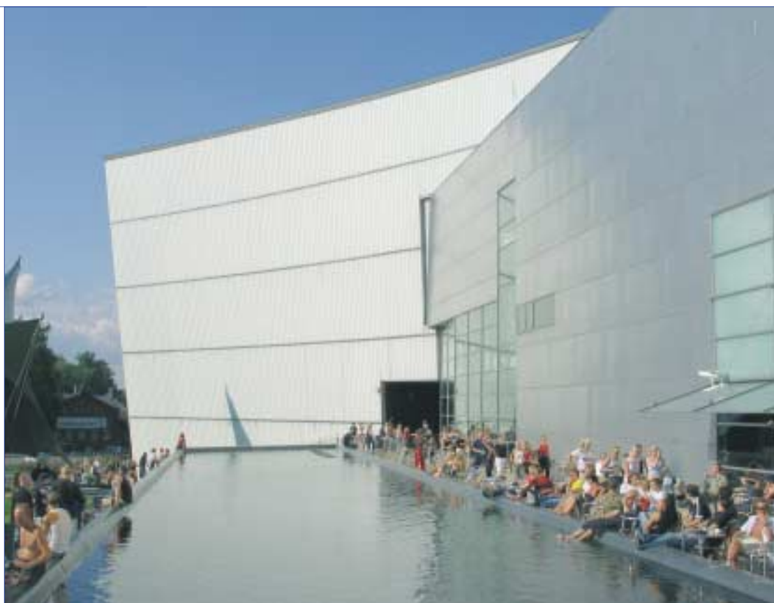
Museum of Modern Art, Helsinki