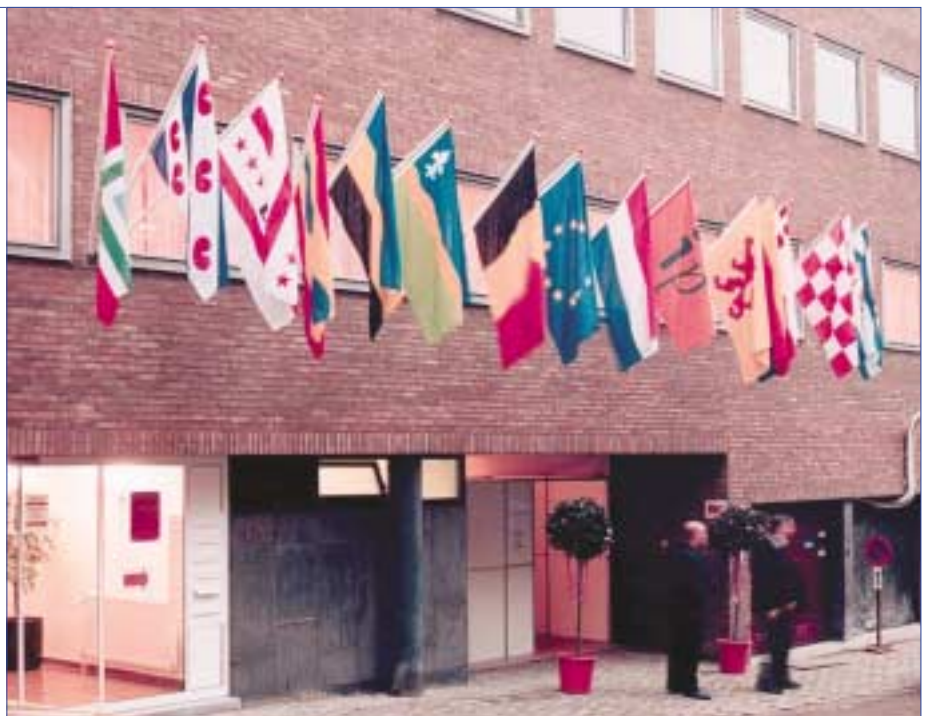
The Dutch House in Brussels

For more information see also our website: http://www.nl-prov.be